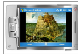
A famous painting watched on a PDA

Up until late 2006, PDAs had been used on board the International Space Station (ISS) mainly as personal computing or entertainment platforms.