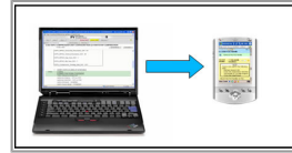
Procedure Viewer on a laptop and on a PDA

An example of laptop to PDA conversion, developed by industry using ESA research and development funding, is the porting of the ESA/NASA International Procedure Viewer (IPV) application. In this type of conversion, the critical factor is adapting the laptop based user interface to a new platform where the available screen area is significantly smaller.