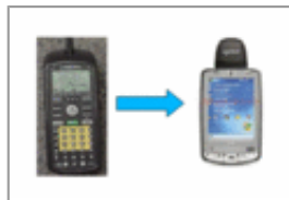
PDAs and the IMS Application

In the near future, PDAs will start being used as integrated components of real applications.